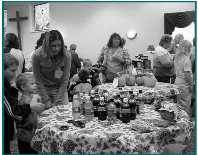
Children were entertained in their own special area with activities and prizes.

Fuel your flame with spiritual "kindling"---